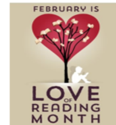
Olanta Creative Arts and Science Magnet School